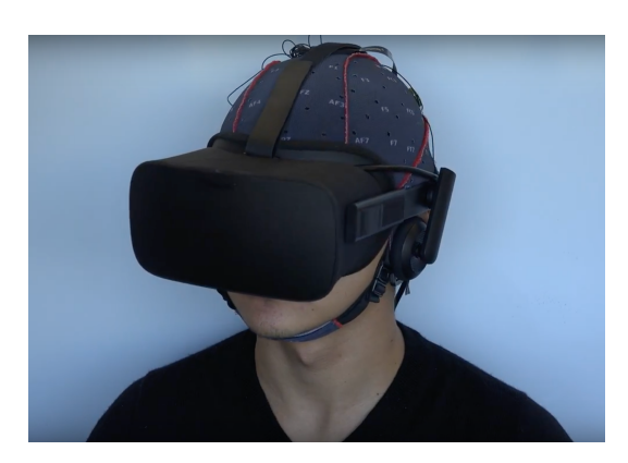
Figure 2: User Device – A user wearing the G. Tec Nautilus EEG headset and Oculus Rift VR Headset using 3D BrainPainting.

Figure 1: Brain Painting 3D Interface – On the left side, the 2D panel used for visual stimuli is shown. On the right side, the 3D Canvas and Cursor are shown.