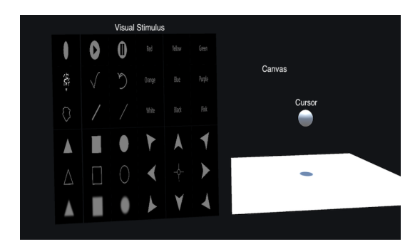
Figure 1: Brain Painting 3D Interface – On the left side, the 2D panel used for visual stimuli is shown. On the right side, the 3D Canvas and Cursor are shown.